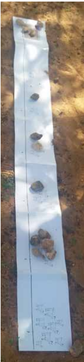
12 REAP graduates participated in a focus group, using rocks and a paper scale to describe the impact of the program on their social standing and empowerment.