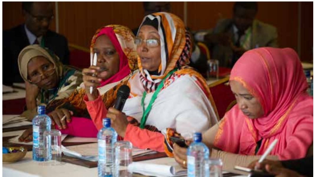
Bottom right: the all-woman government delegation from Sudan.

government officials from Kenya, Ethiopia and Sudan joined academic researchers, multilateral and bilateral funders, and funders, NGO leaders (including representatives from UNICEF, the World Bank and the World Food Programme) and members of the press to to learn about the latest research in the field of poverty graduation, BOMA’s experience in implementing its program in the drylands of Africa, and the challenges and opportunities of integrating the approach into the national social-protection agenda in Kenya and beyond.