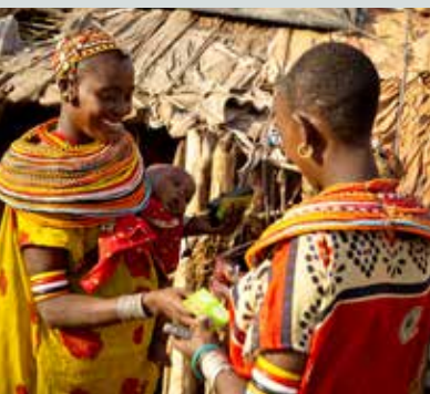
REAP women selling mobile phone SIM cards

In a remote region where cellular networks have only recently arrived, we believe in helping ultra-poor women to move from a cash and credit based economy to a new world of financial inclusion and empowerment through mobile banking.