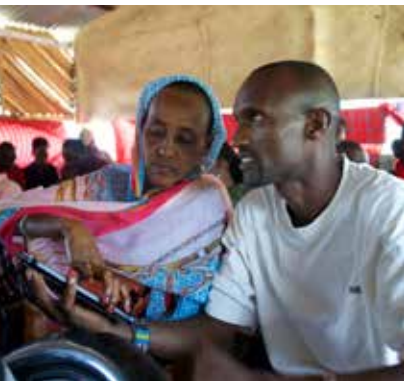
82% of participants report receiving “excellent” support from their Mentor. Above, BOMA mentors at a training session.